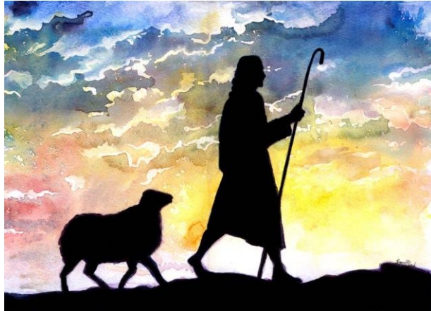
I want to Follow the Shepherd Signe Flink