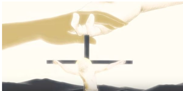
A clip from Full of Eyes.com

When Jesus hung on the cross, and the sky darkened and the earth began to tremble, only the eye of God could see the evil, the corruption in us all funneling into his dying body, opening the way for a world far better than this one: God's Kingdom.