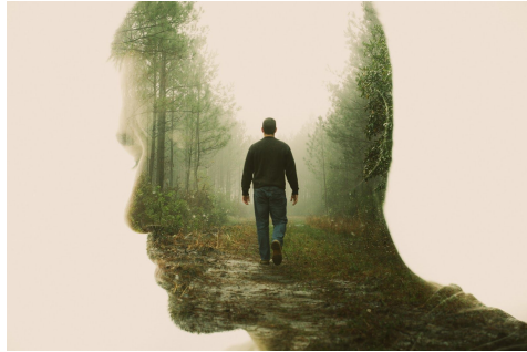
FIGURE IT OUT

Don't expect some prophet to tell you what's going to happen next.