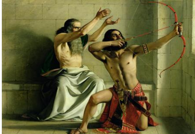
Joash Shooting the Arrow of Deliverance (1844)