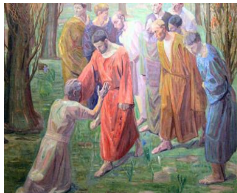
Healing a Leper 1913

"If any one wants to come after me, let them deny themselves, take up their cross and follow me."