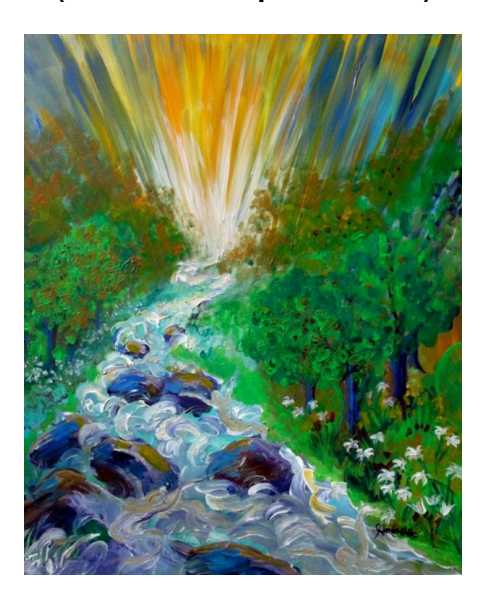
Wherever the river flows, life will flourish.