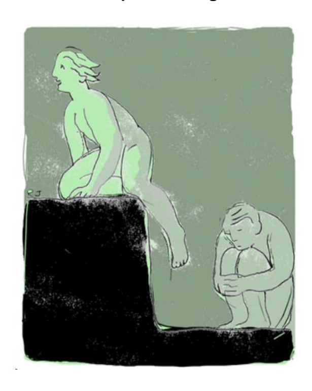
The Lord God has given me the tongue of those who are taught, that I may know how to sustain with a word him that is weary.