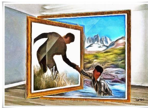
One to Another

The Lord GOD has given me the tongue of those who are taught, that I may know how to sustain with a word him that is weary. Morning by morning he wakens, he wakens my ear to hear as those who are taught. (Isaiah 50)