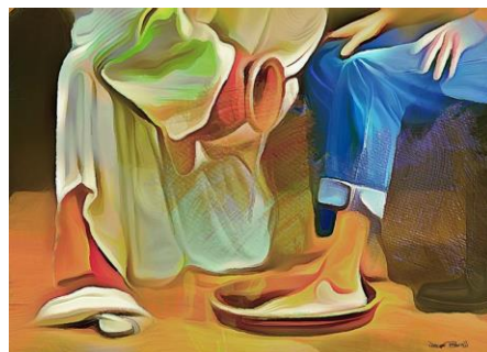
Wash one another's Feet