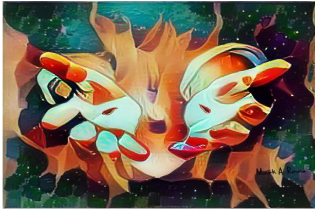
Hands of Fire