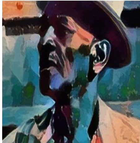
The Blues (a study)