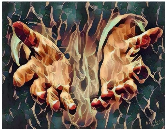
Such as I Have