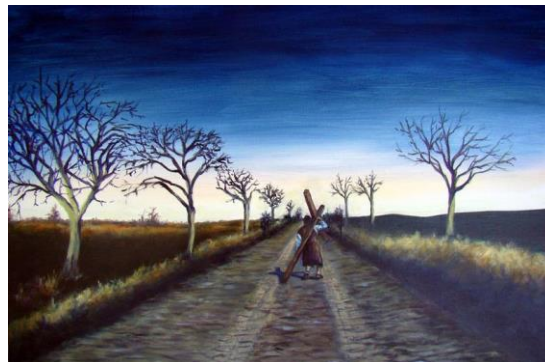
Take Up Your Cross