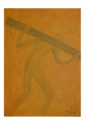
"To a cross."

Along the way you will bring good news to the poor.