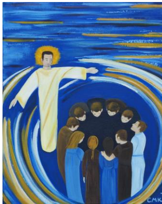
I am With You Always

"And lo, I am with you always, to the close of the age."