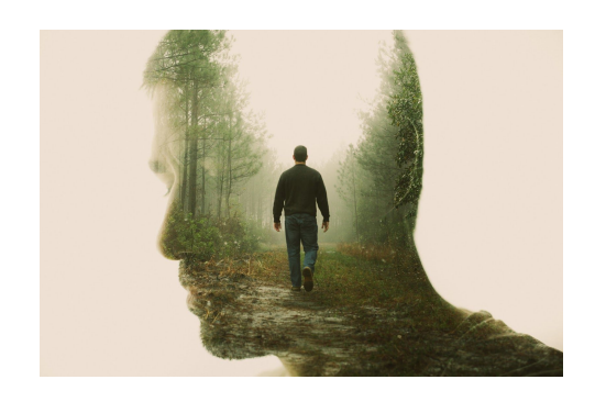
FIGURE IT OUT

Don't expect some prophet to tell you what's going to happen next. Figure it out yourself.